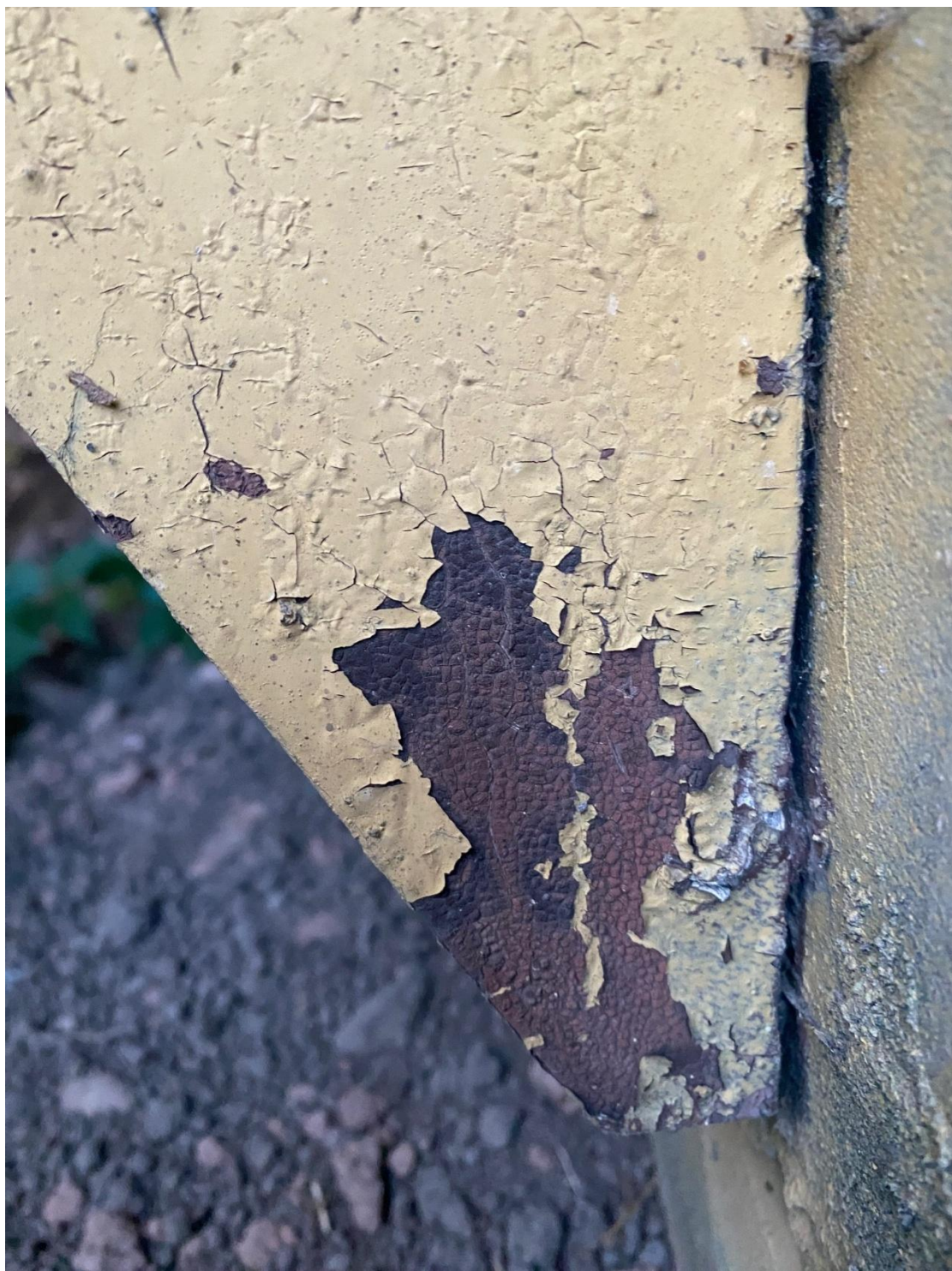
Photo: Brown paint on the trim underneath the current yellow paint.