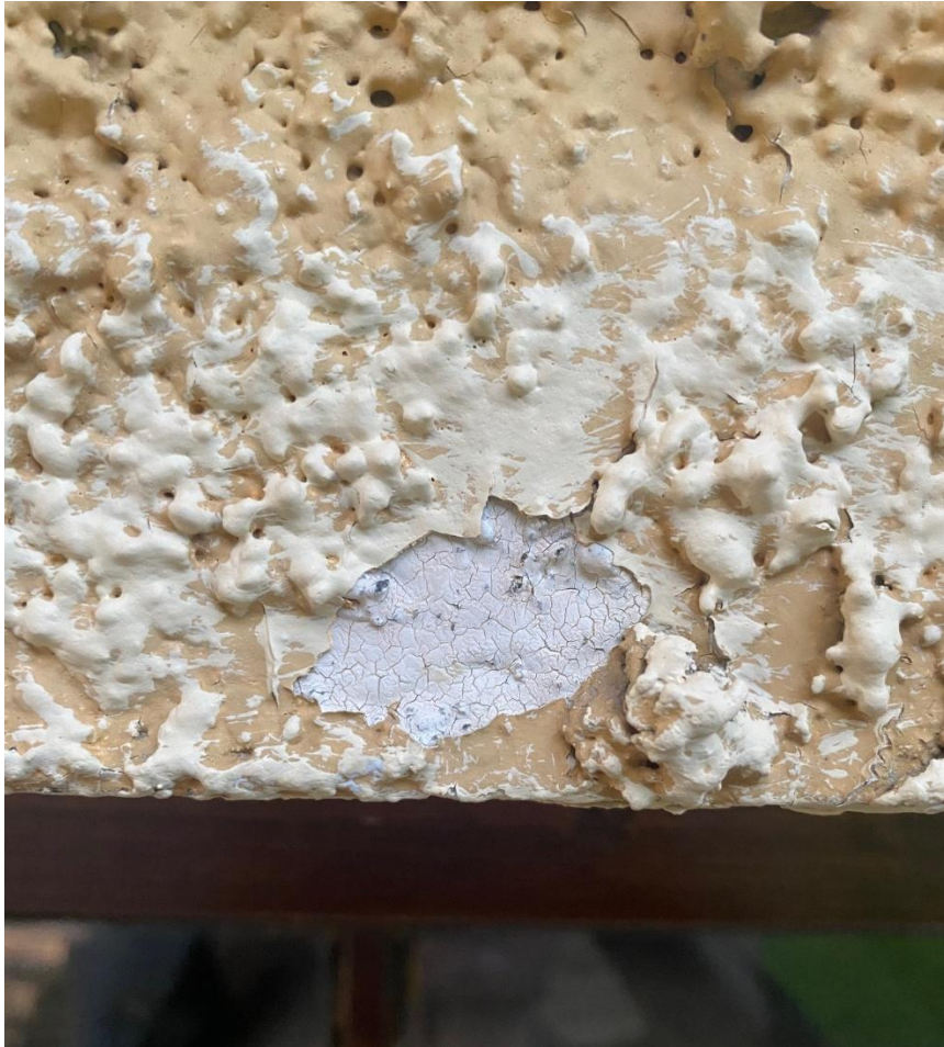
PHOTO: Layers of paint on stucco (white underneath) the other light colour is one was a test.