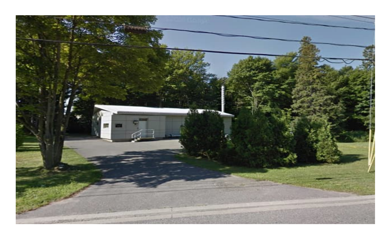
Clark Creek Lift Station

John St. Young and Main station flow to the west end wastewater pollution control plant. John street can also be diverted to the east plant if needed.