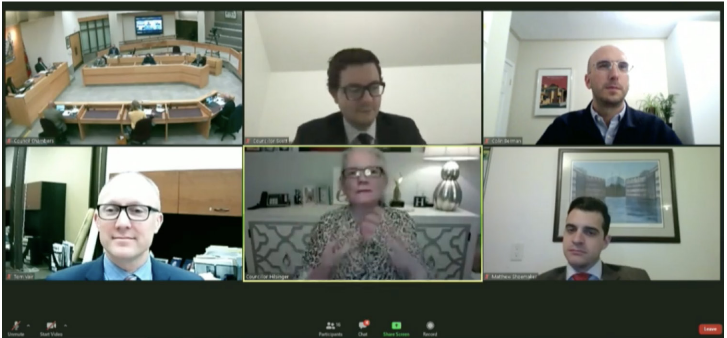
Council Presentation on Zoom on September 28, 2020