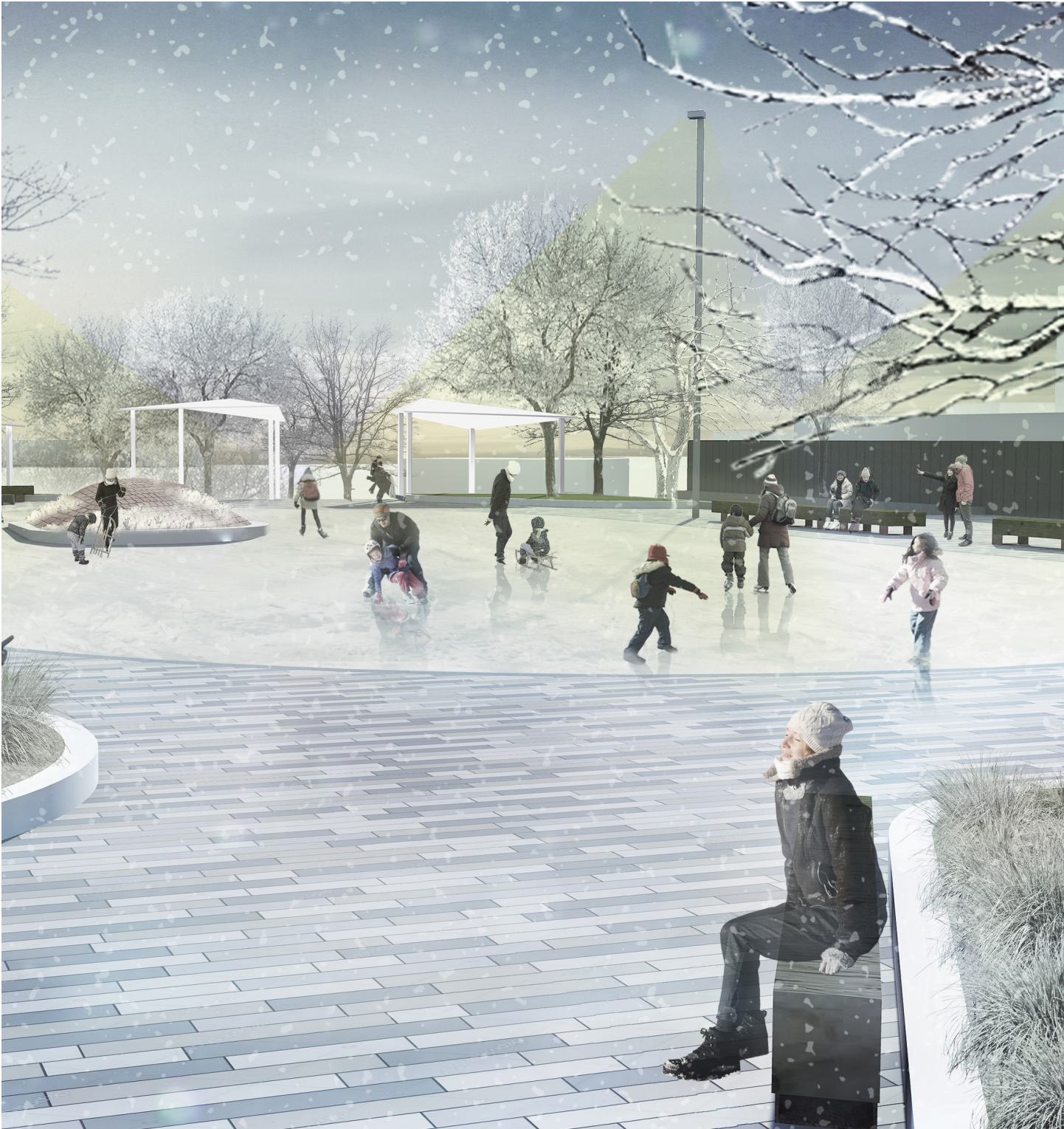
Conceptual Rendering of Winter Skating