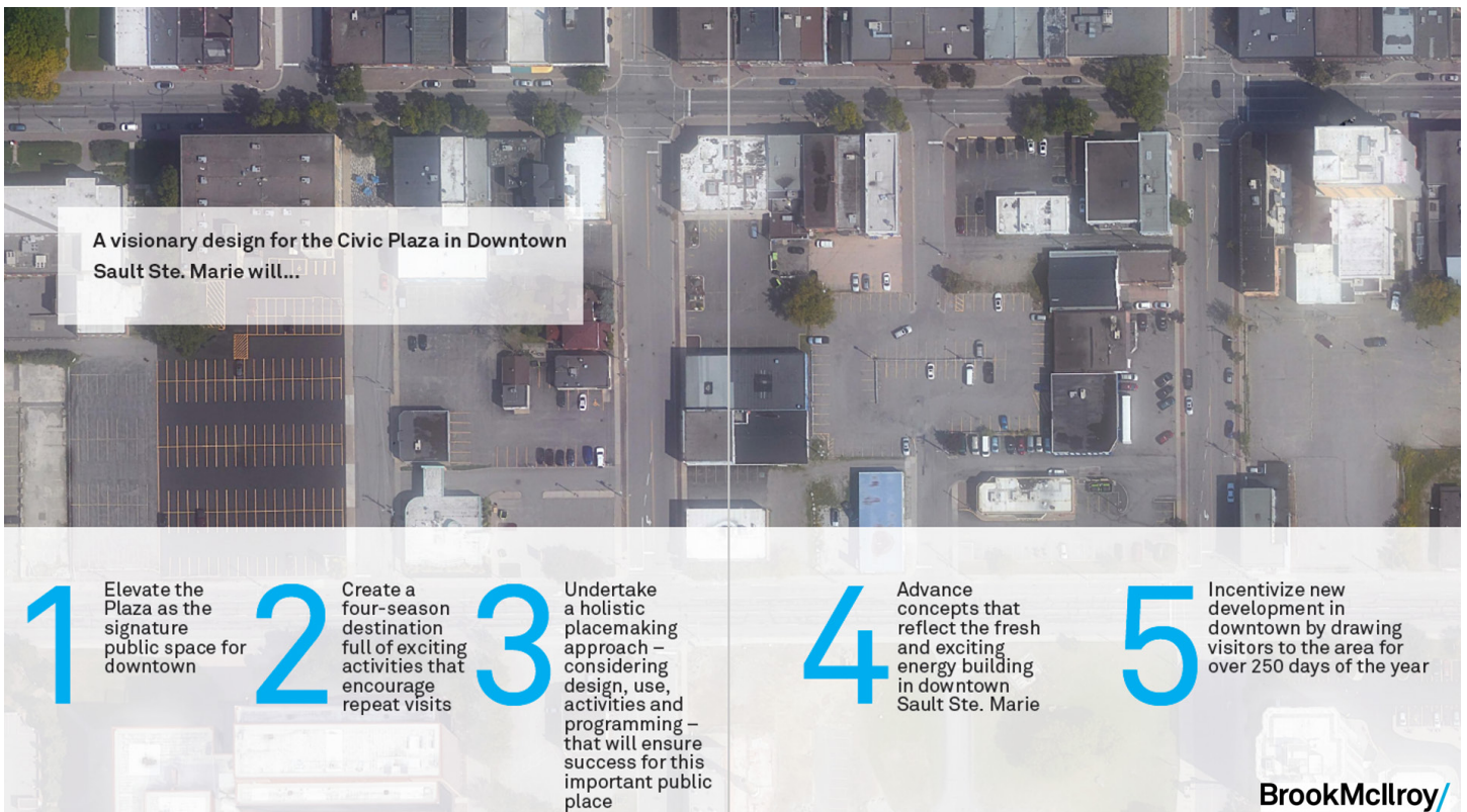
Project Objectives Presented to Council