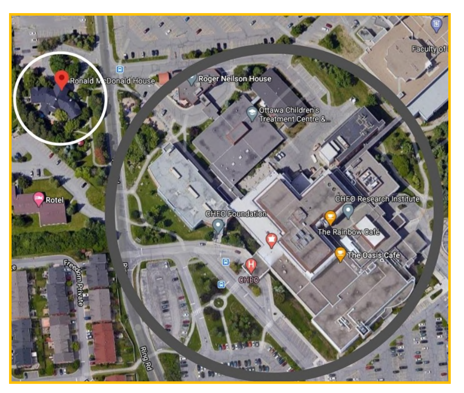
Page 125 of 142

RMHC Ottawa is a mere 167 steps away from CHEO.