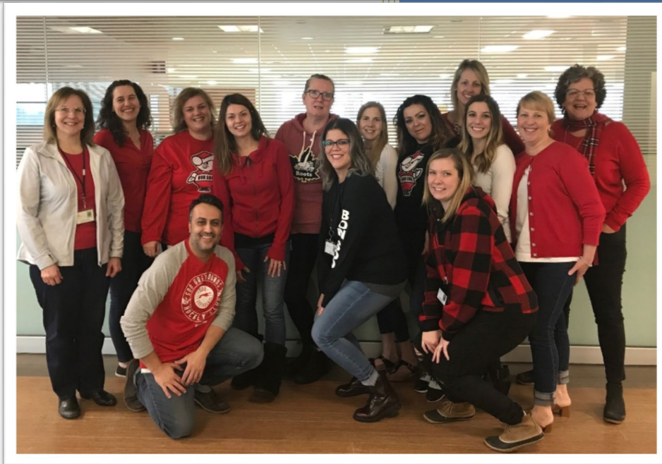
Bon Soo Spirit at APH! Staff show their community spirit by dressing for Bon Soo Red & White day.