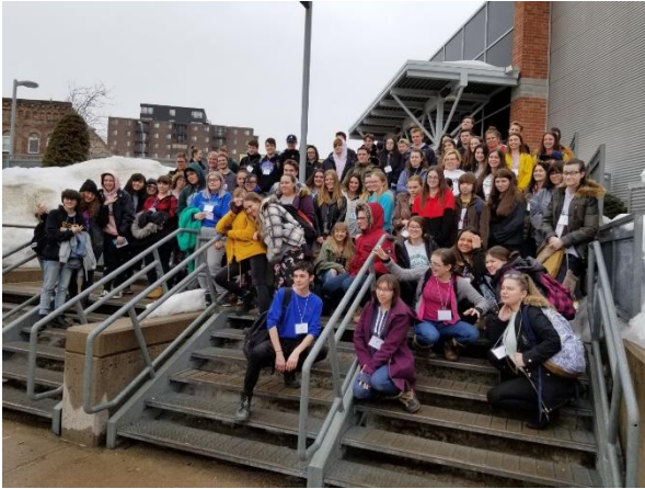
Students at the kick-off event in March