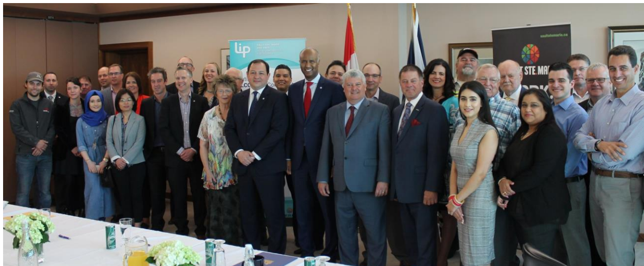
The Rural and Northern Immigration Pilot announcement, Sault Ste. Marie, June 14, 2019

FutureSSM will continue to work with the Sault Ste. Marie Economic Development Corporation, the Sault Ste. Marie Local Immigration Partnership and other partners to support this pilot so it can be as successful as possible in growing our community.