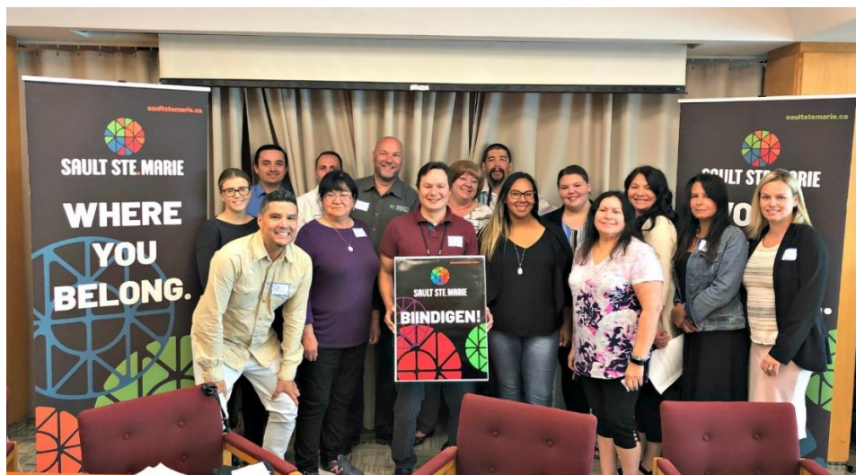
Participants of the latest Indigenous Employment Roundtable at City Hall