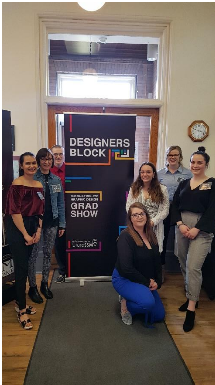
The 2019 Sault College Graphic Design students at their Grad Show, Designers Block