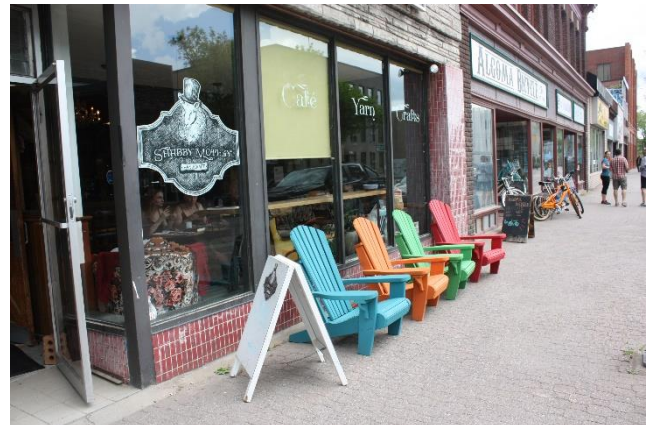
Muskoka chairs in front of Shabby Motley Handcraft on Queen Street