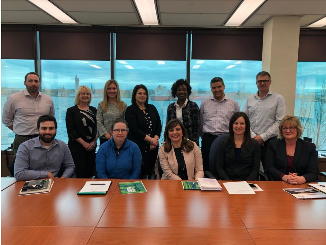
The first ever Sault Ste. Marie Spousal Recruitment Advisory Committee meets at City Hall in June