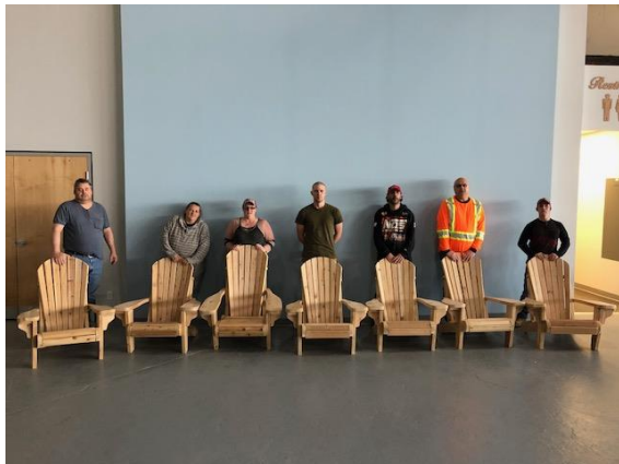
Participants in the Ontario Works Construction Training Program in front of Muskoka chairs they built

FutureSSM partnered with the District of Sault Ste. Marie Social Services Administration Board - Ontario Works, and the Canadian Bushplane Heritage Centre Construction Training Program to build public furniture that is now being used by businesses in Sault Ste. Marie's downtown core.