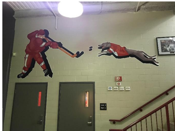
Mural designed by Magnolia Lui located in the Hockey Hall of Fame