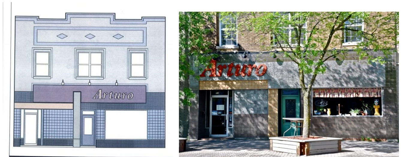
Figure 3 Arturo Ristorante