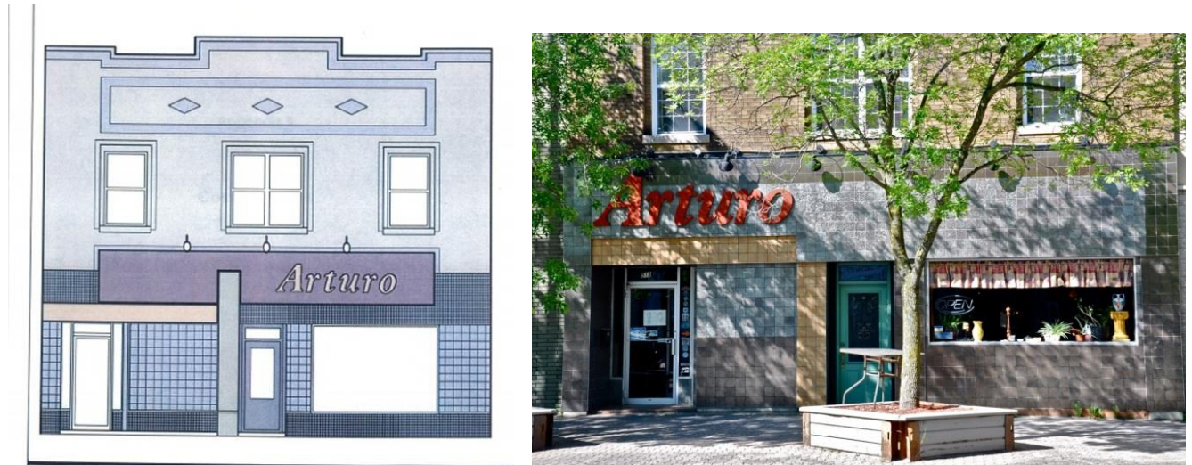
Figure 3 Arturo Ristorante