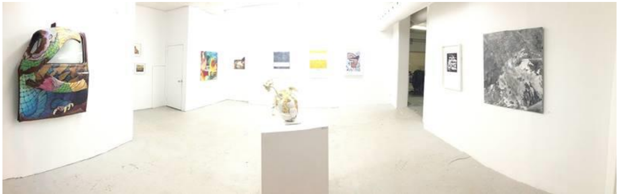
Figure 2: 180 Projects