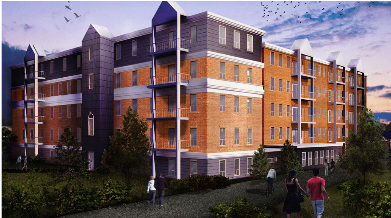
Figure 1: Riverwalk Condominiums