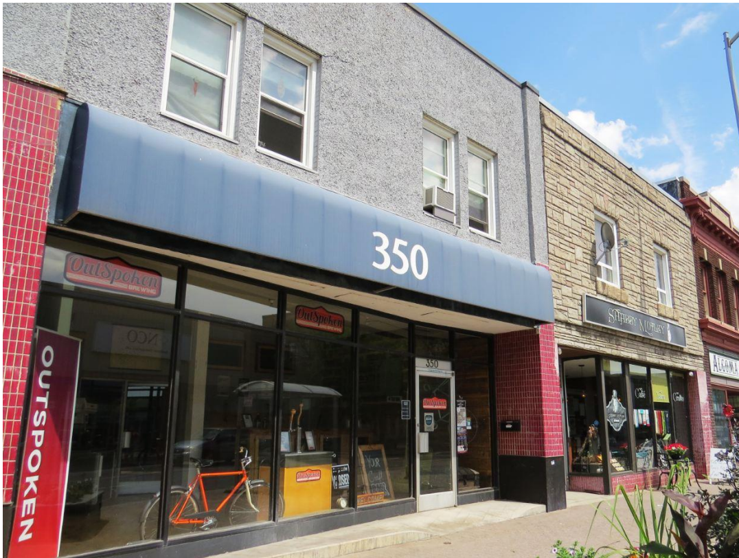
Figure 4 Upper Floor Apartments