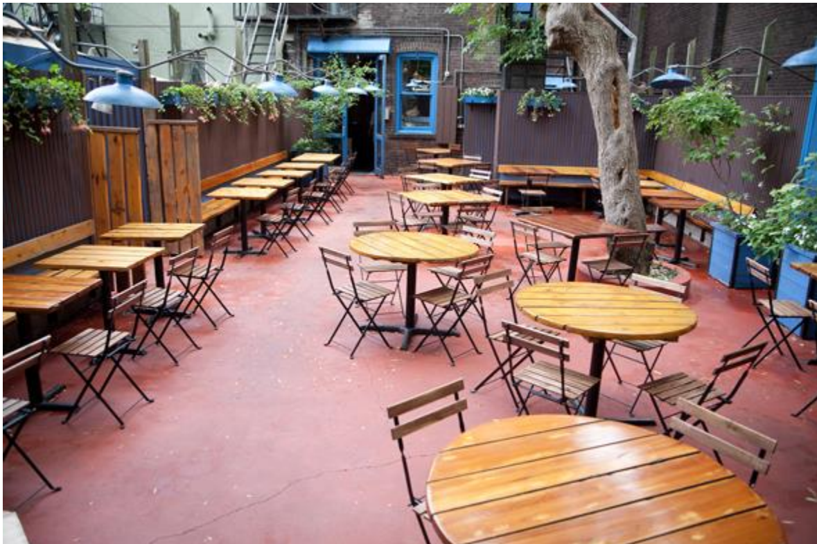
Figure 5 Rear-yard Patio